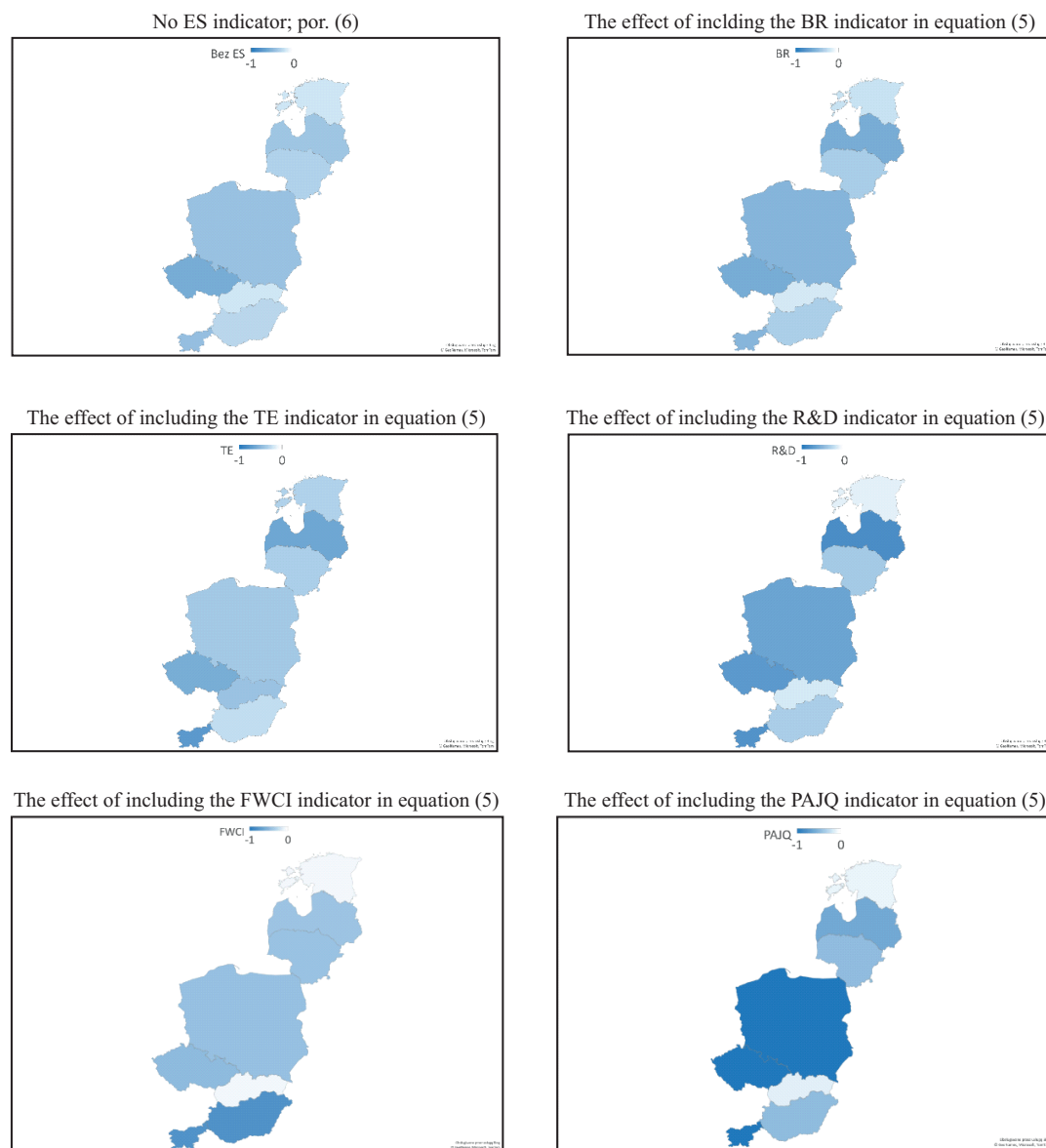
Figure 1. Variability in the estimates of the convergence parameter obtained in all analysed SURE models

model (6) and the other two models with the BR and TE variables introduced, respectively. In the case of the model (5) with the R&D variable, the estimated catch-up effect is most strongly amplified in Latvia, Slovenia, the Czech Republic, and Poland. Estonia and Slovakia show a slower estimated catch-up rate than the results obtained from the other models. To some extent, a similar effect is observed for the model (5) with the TE indicator, but it is much less pronounced. Incorporating the BR indicator in the convergence model does not fundamentally change the obtained convergence parameter estimates. The analysis of the impact of the FWCI and PAJQ